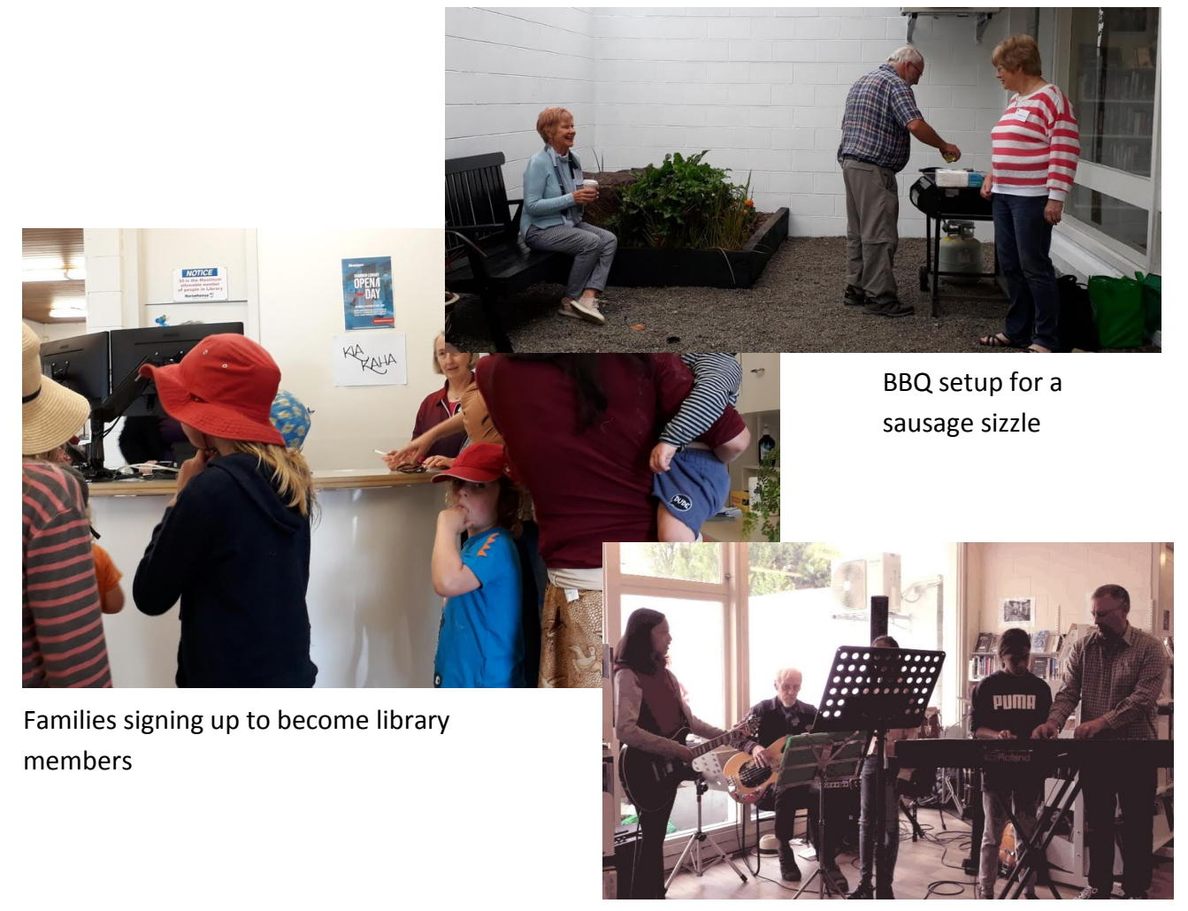
Talented locals playing with the band