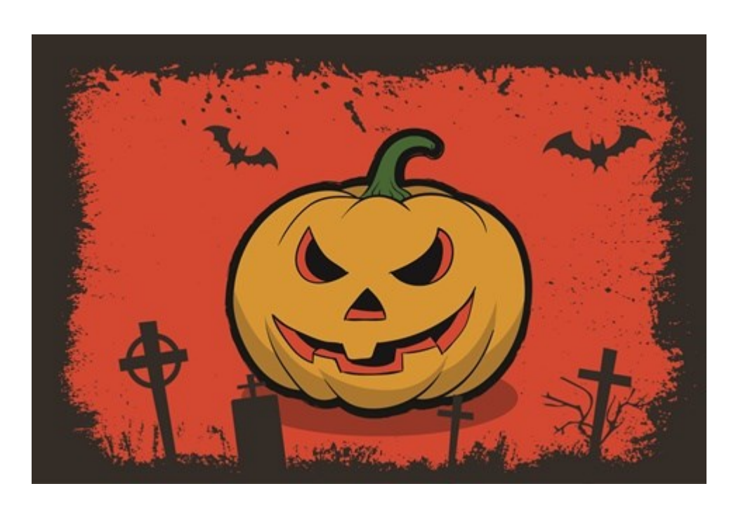
Friday, 30 October 2020 | 08:00 PM to 09:30 PM

The nights are growing darker, the shadows creeping in and we are all set for mischief, movies and mayhem.