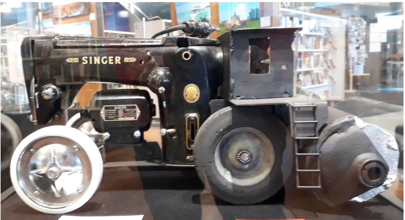
Singer Traction engine