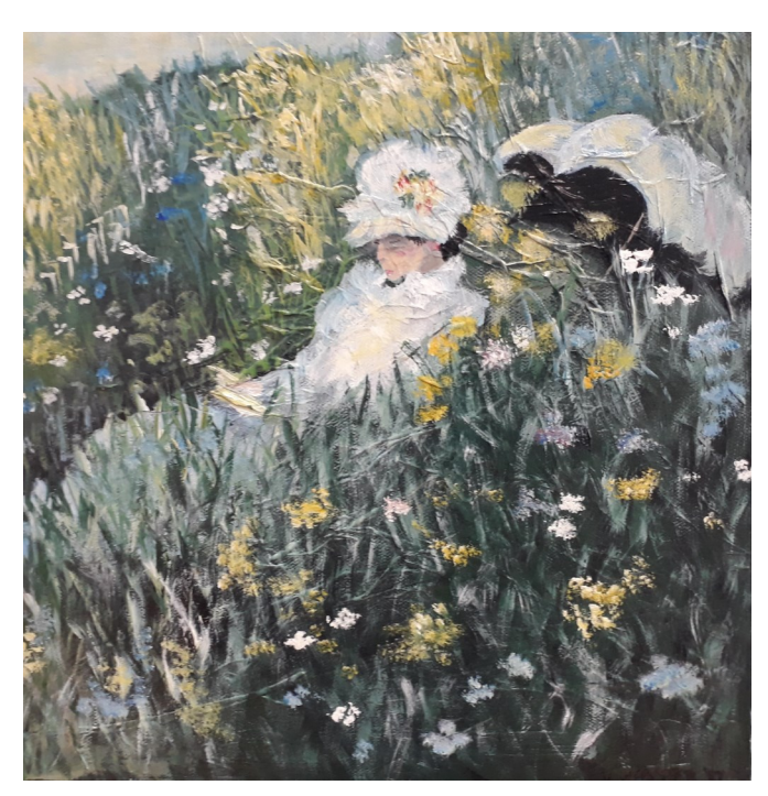
In the meadow