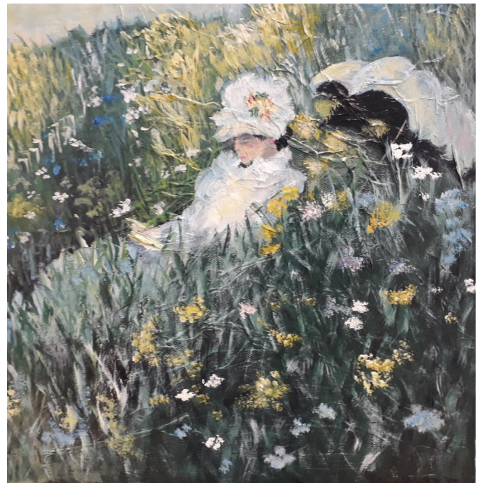
In the meadow