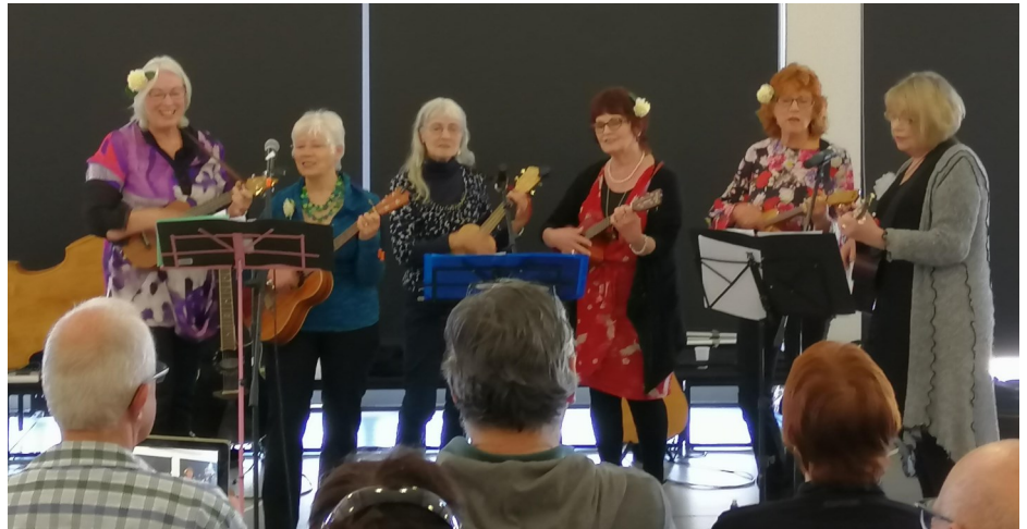
Stringalong performing at Te Takeretanga o Kura hau Po

The two concerts, one at Te Awahou Nieuwe Stroom and one at Te Takeretanga o Kura Hau Po on Friday and Saturday kept everyone entertained from 12.00—1.00pm on those days. It was good to see that the bus trip from Te Takeretanga o Kura Hau Po to Te Awahou Nieuwe Stroom was well patronised. We hope you enjoyed your visit there on Friday.