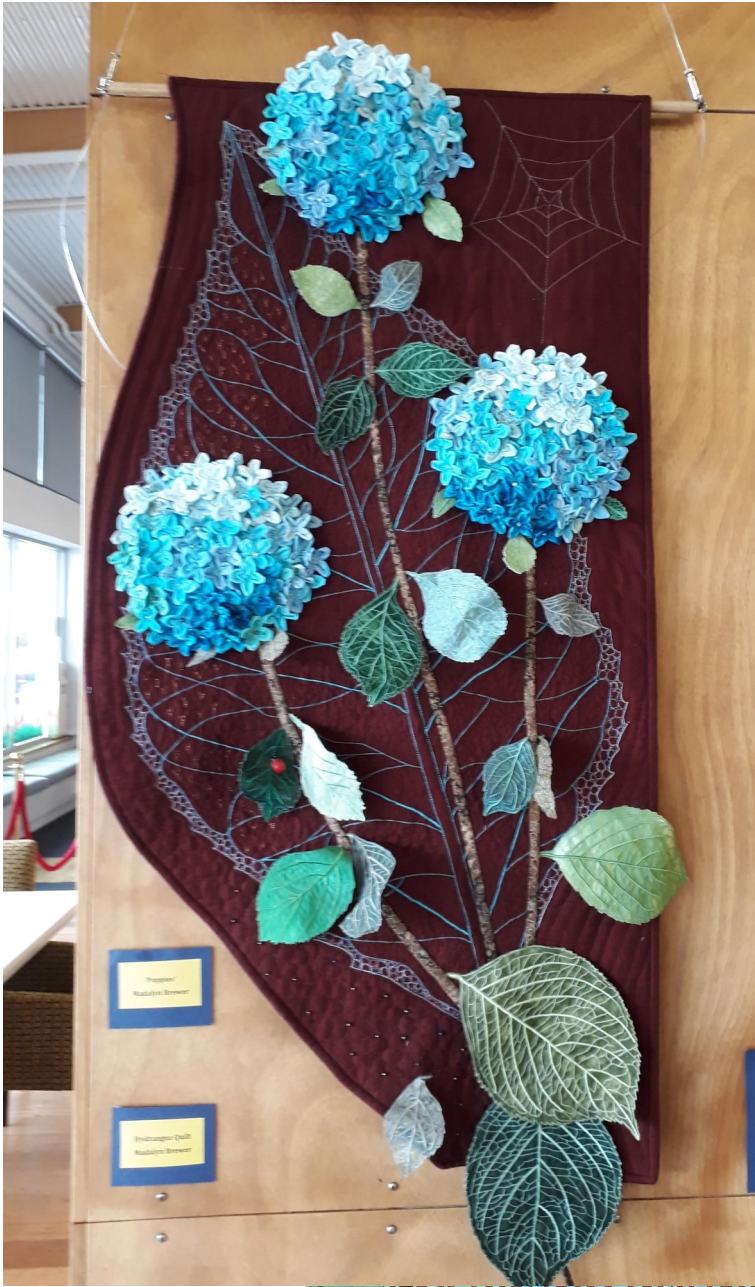
Hydrangeas by Madalyn Brewer