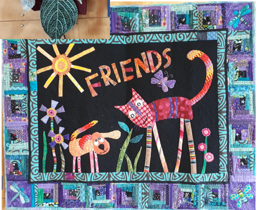
Friends by Griet Lombard