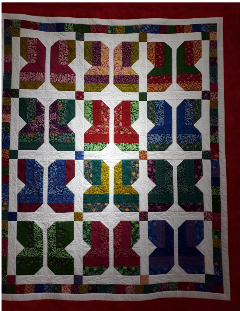
Butterflies galore by Ute Ruschhaupt