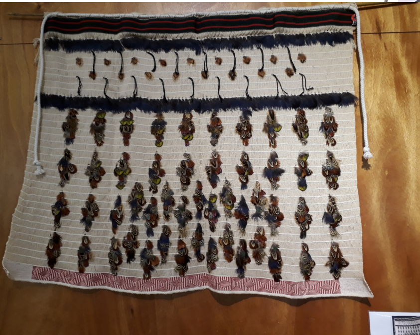
Whakawhanake —to improve

A cloak representing the soldiers who are now stars in the night