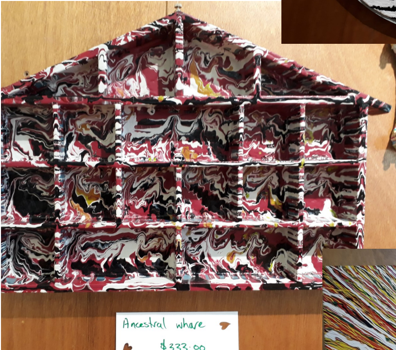
Ancestral whare $333.00