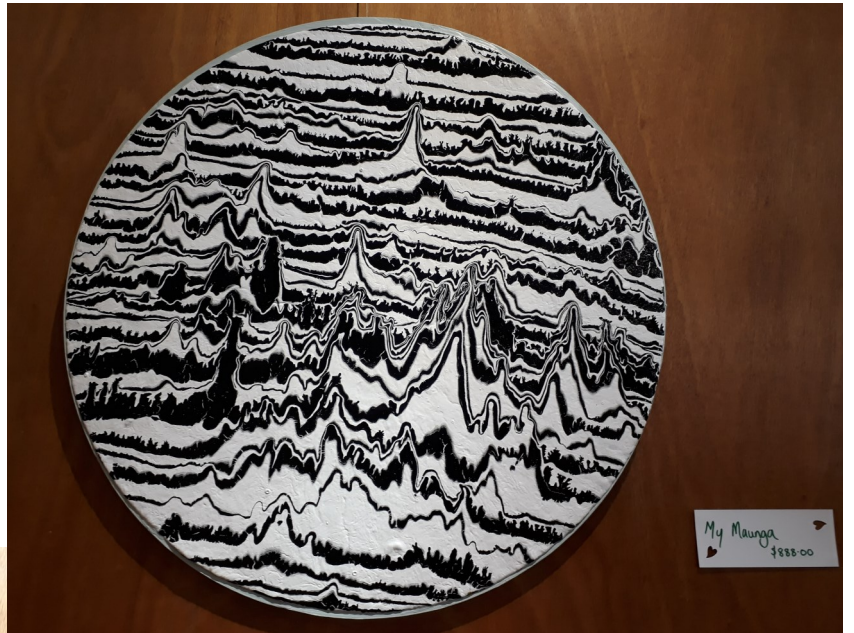
My Maunga $888.00