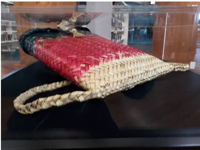
Pikau —natural Red & Black non Traditional dyes made by Ina Jensen